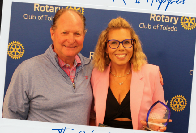
The Golf Gurus