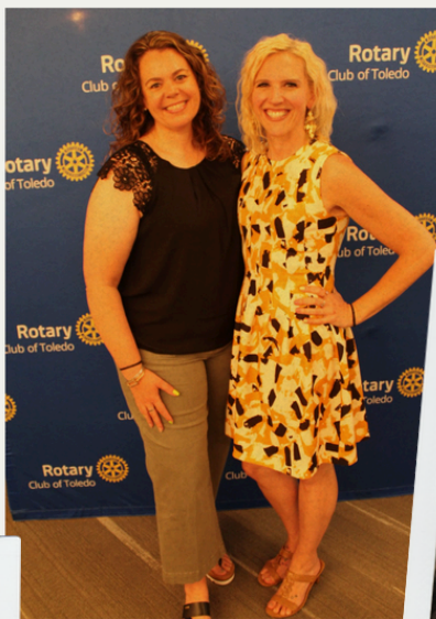
Strike a Pose