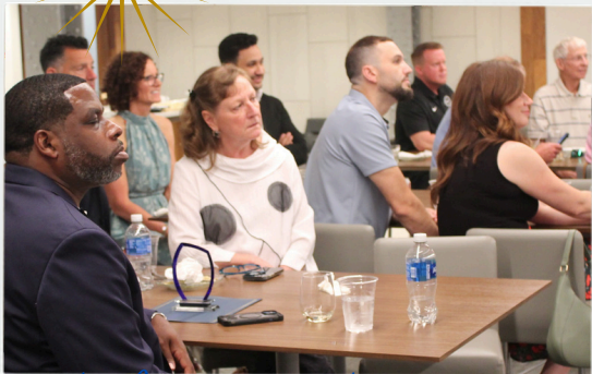
Thank You for Showing Up