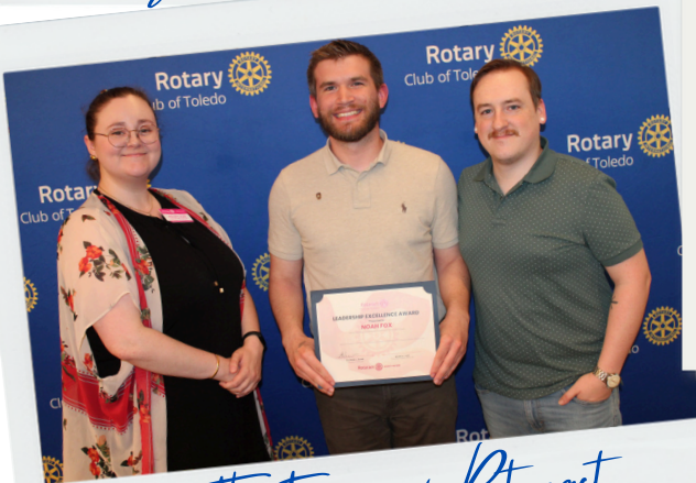
The Faces of Rotaract