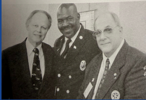
July 11, 2003 THE TOLEDO ROTARY SPOKE