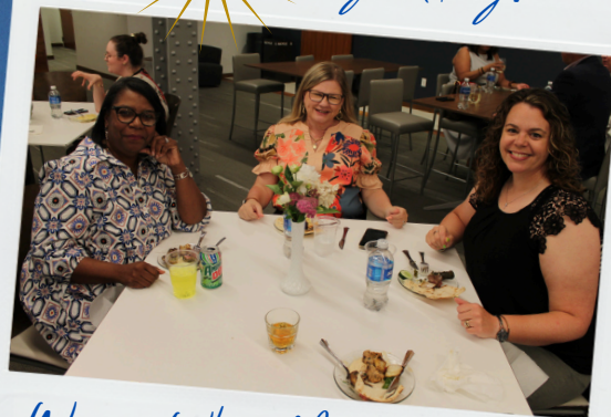
Women Who Make It Happen