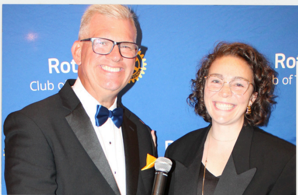
The dynamic duo behind the mic