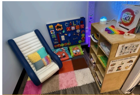
Make a gift to the Toledo Rotary Foundation here.