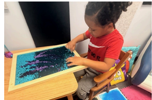
Join the Youth Services Committee today!