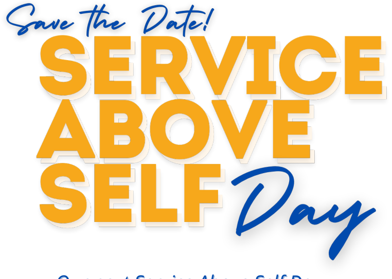
Our next Service Above Self Day is scheduled for Monday, June 30<sup>th</sup>.