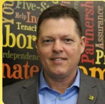
Ash Lemons Ability Center