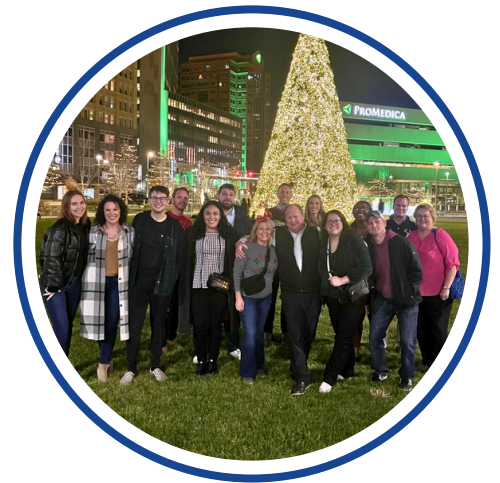
PICTURED ABOVE: PHOTOS FROM THE 2023 FIRST EVER HOLLY TROLLEY EVENT

The Membership Committee is pleased to host this social event that we hope will become an annual tradition!