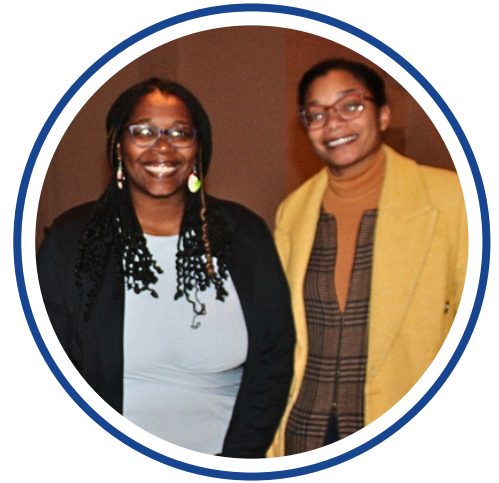
PICTURED ABOVE: PHOTOS FROM THE 2023 HOLIDAY PARTY AT REGISTRY BISTRO DOWNTOWN

As the calendar year comes to a close and families come together to celebrate the holiday, Toledo Rotary celebrates in style with its annual Holiday Party - The social highlight of the year!