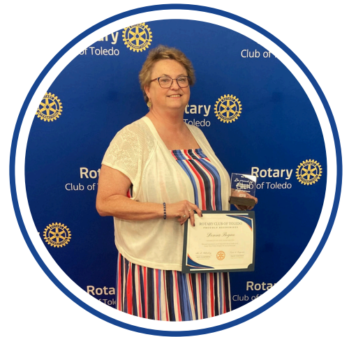
PICTURED ABOVE: PHOTOS FROM THE 2024 MEMBER AWARDS AT SHUMAKER, LOOP & KENDRICK

As the Rotary year comes to a close, Toledo Rotary and Toledo Rotaract celebrate their members with its annual Member Awards event. Rotary and Rotaract members, partners, & guests join in an evening recognizing the hard work of many individuals, including Leader of the Year, New Member of the Year, and Rotaract Impact Person of the Year.