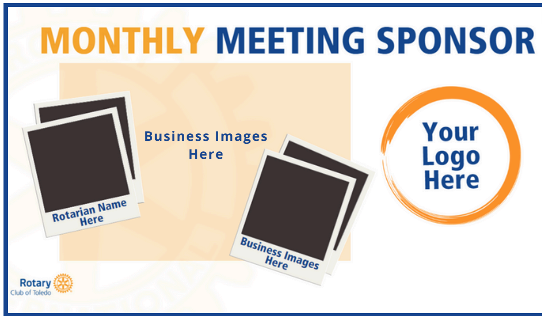
PICTURED ABOVE: SPONSOR SLIDE AT MONDAY PROGRAMS

Monday Meetings are the cornerstone of Toledo Rotary and its members. Each Rotary meeting showcases a speaker whose leadership and message is pertinent and relevant to leaders in our community.