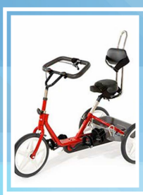
Adaptive Tricycles for Inclusivity at Anne Grady Services