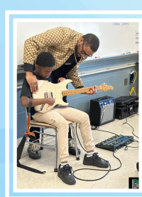
Empowering Future Leaders Program at Big Brothers Big Sisters of Northwestern Ohio