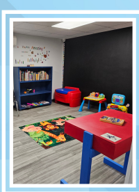
Shelter Updates at Beach House dba Leading Families Home