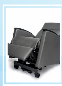
Patient Room Recliner Replacement at Hospice of NWO