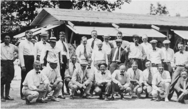
Toledo Rotarians visit Camp in 1918