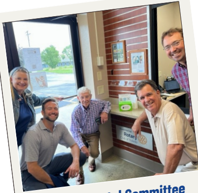
Environmental Committee Visits Natures Nursery