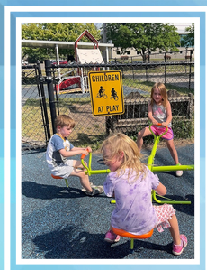
Outdoor Enrichment at Toledo Day Nursery