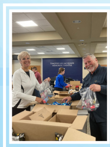
Annual Food Pack benefitting Connecting Kids to Meals