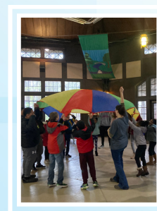
Camp Day with Glendale-Fielbach and Disability Services