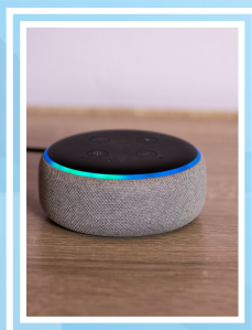
Echo Dot Program at VOICEcorps Reading Service