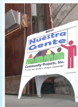
Security Cameras for Nuestra Gente