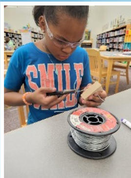
Toledo Tinkers at Imagination Station

Donations to the Toledo Rotary Club Foundation are used to support projects in and around Toledo, regionally, and internationally. Donations of any amount are gratefully accepted, and Rotarians who donate $250 or more annually will be a member of the President's Club. Each year, the Toledo Rotary Club Foundation grants more than $200,000 annually to local, regional, and international 501c3 groups to better our communities.