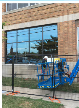
New Windows at Cherry St. Mission