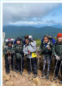
Wilderness Equipment for Toledo Mountain Mentors