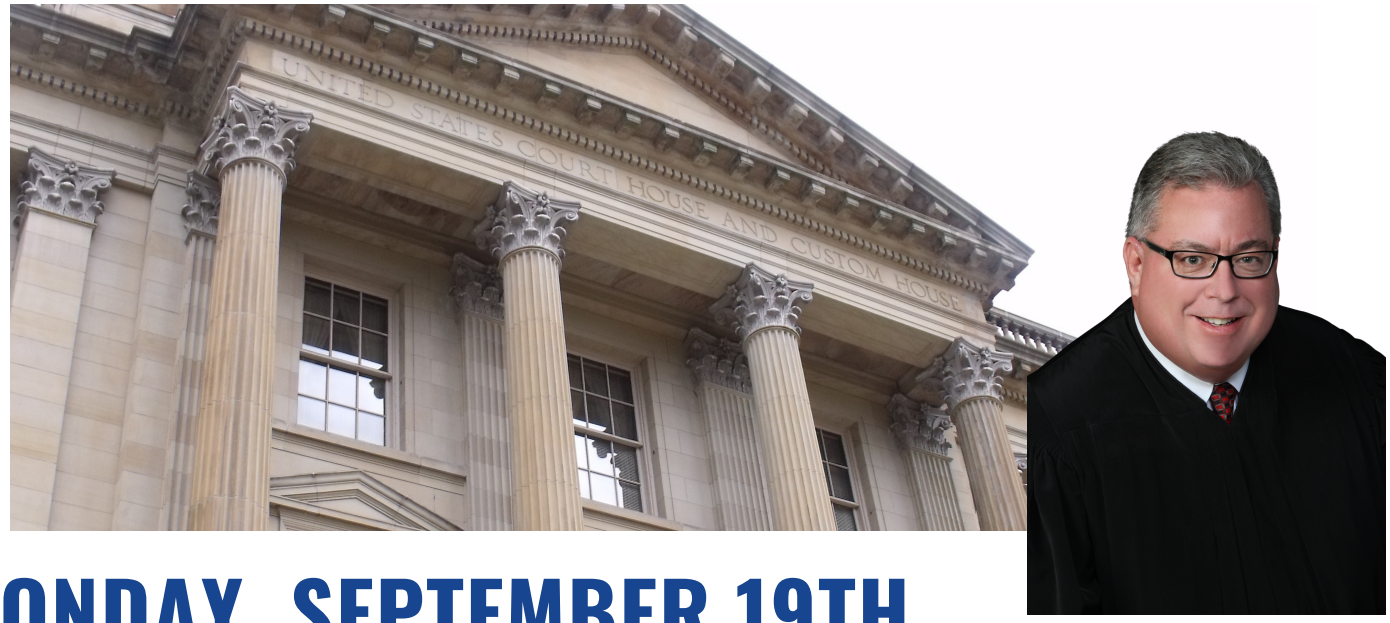
MONDAY, SEPTEMBER 19TH

Guns and Drugs - Making a Federal Case of It