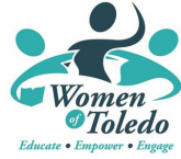
Nina Corder Women of Toledo