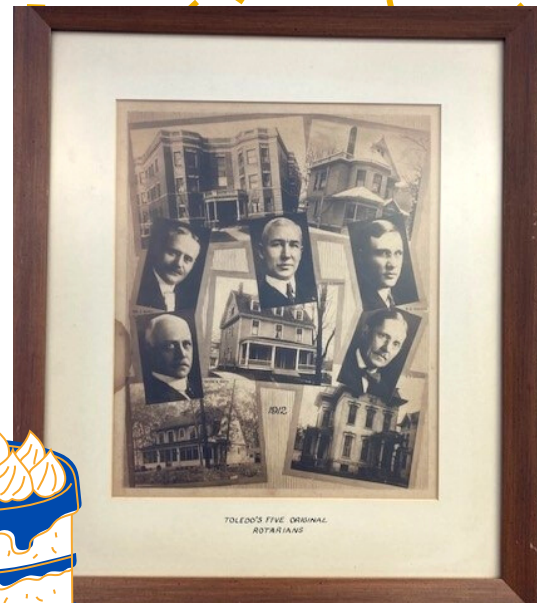
Pictured are the 5 original Rotarians who started our club.