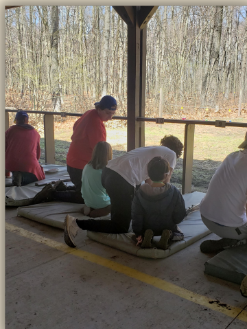
St. Francis students work with the G.F. students to learn how to shoot B.B. guns (pictured left).