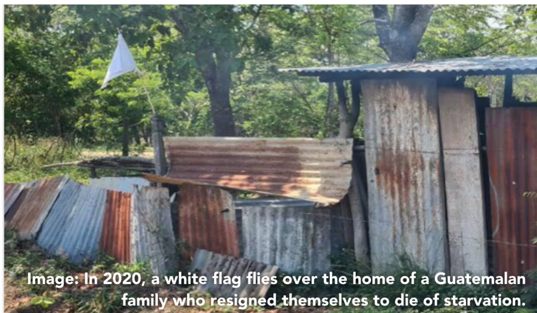
Image: In 2020, a white flag flies over the home of a Guatemalan family who resigned themselves to die of starvation.

For more information or to get involved, visit: sewhope.org/community-food-packing-event