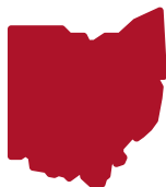
Rep. Bob Latta (OH-05) Congressman State of Ohio