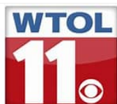
Dan Cummins Broadcaster/Journalist