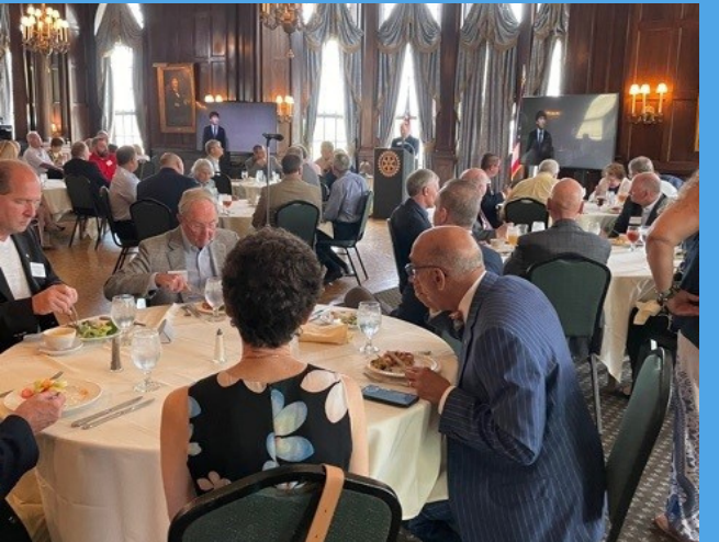
Rotarians once again enjoy lunch, fellowship & the long awaited return to new & old friendships!