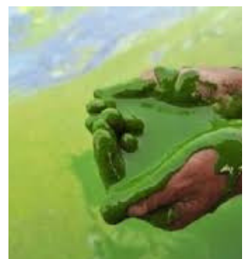
Lake Erie Water Crisis Conference