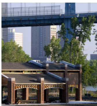
Middle Grounds Metropark