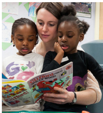
Early Literacy Development