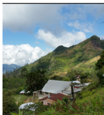
San Pedro Sula