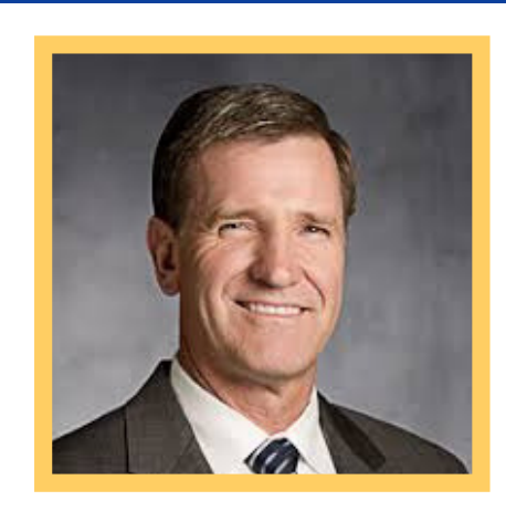
MONDAY, MARCH 11, 2019 RECAP