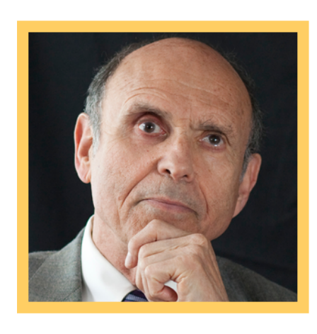
MONDAY, MARCH 4, 2019 RECAP