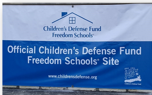
Top: The Freedom School Banner